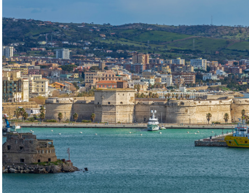
Left photo: Amphitheater of Taormina / Right photo: Harbor of Civitavecchia