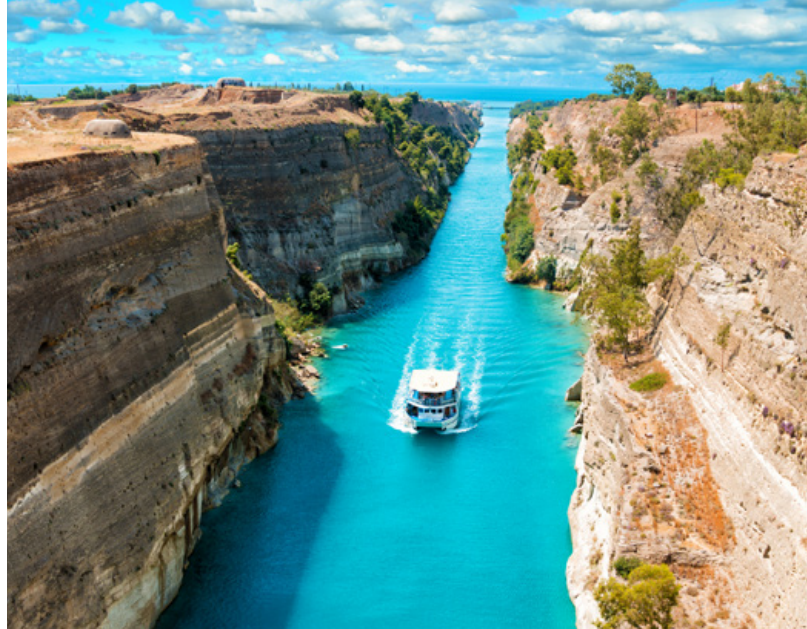
Right photo: Corinth Canal