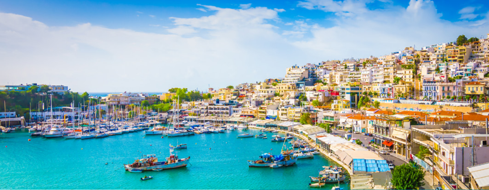
Port of Piraeus